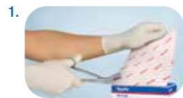
1. Cut Hypafix® to size.