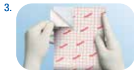
3. Remove the narrow part of the release paper ...