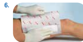
6. Pull the release paper with Hypafix® over the wound dressing...