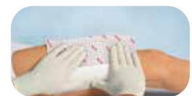
...or push the release paper with Hypafix® over the wound dressing.