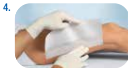
4. ... and apply the fixation edge on the surrounding skin.