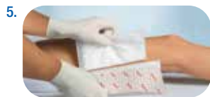
5. Fold back the remaining part. Position the wound dressing as required and fix with the adhesive edge.