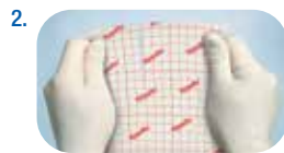
2. Open the split liner by pulling slightly apart.