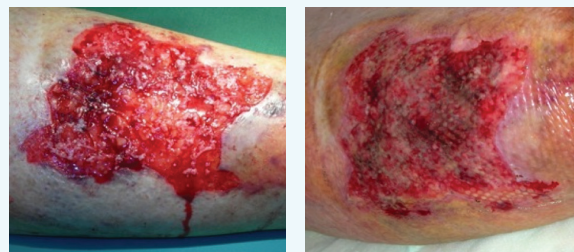
Figure 3: Small fragments of minced skin are demonstrated on the left and coalescing of the fragments is demonstrated on day 8 on the right.

ing and be protected from infection. Soaking the graft fragments with Vashe at each dressing change provides protection to them as they coalesce into a solid sheet of skin to complete closure of the wound (Fig.3)